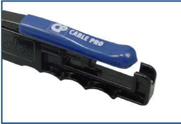
Linear Compliant Compression Tool (SLM)