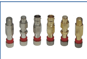
Standalone Splice (Female) Connectors