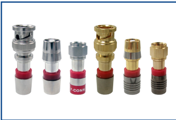
F-Conn Universal Connectors