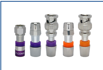
RGB/Mini Coaxial Connectors