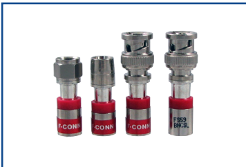
Plenum and Security CCTV Connectors

**Each 2 pack includes 2 posts, (1) Red screw nut and (1) Black screw nut also (2) Red 12 AWG, (2) Green 14 AWG, and (2) Yellow 16 AWG Sleeves. (Requires module clip to fit Wall Plate System)