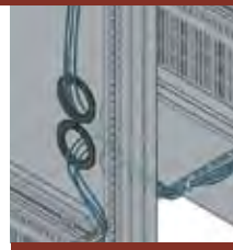
GK4 mounted in ganged ERKs

Grommets protect cables, and can be used on any 4" trade-size electrical knockout or used on 4-1/2" fan knockouts on Middle Atlantic Products top options. Allows for ganging without using expensive electrical fittings. GK-4G gland grommet blocks dust and helps control airflow.