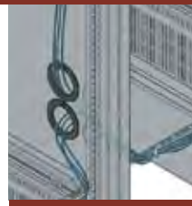
GK4 mounted in ganged ERKs

Grommets protect cables, and can be used on any 4" trade-size electrical knockout or used on 4-1/2" fan knockouts on Middle Atlantic Products top options. Allows for ganging without using expensive electrical fittings. GK-4G gland grommet blocks dust and helps control airflow.