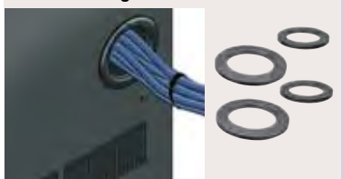
Gland Grommet - GK-4G shown mounted on MW-4FT top option