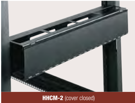
HHCM-2 (cover closed)

Spec. # 96-01003 for full product info. A&E