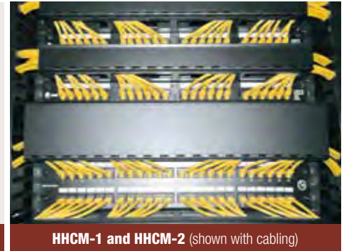
HHCM-1 and HHCM-2 (shown with cabling)