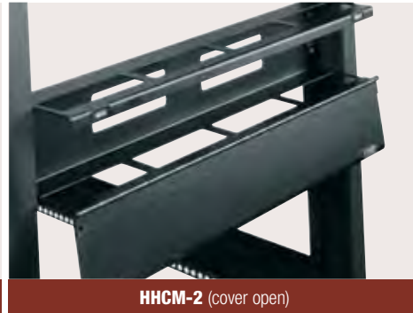
HHCM-2 (cover open)