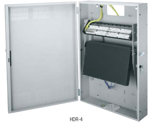
HDR-4 shown with equipment in service position