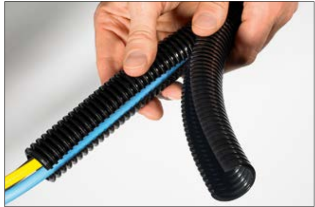
HelaGuard HG-DC double slit conduit is ideal for retrofitting.