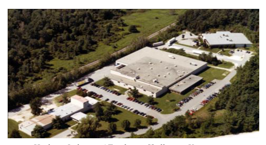
Harbour Industries' Facility in Shelburne, Vermont