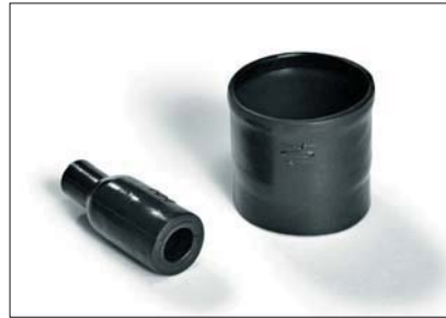
104-4 supplied / fully recovered.

This style is used in conjunction with a circular grooved adaptor providing strain relief and environmental sealing when used in conjunction with one of our complementary adhesives.