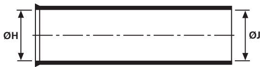
a: Expanded form (supplied)

For Material / Adhesive selection and other information please refer to page 10.