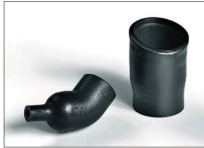
1821-42 supplied / fully recovered.

This style provides strain relief and mechanical protection for harness systems when used in conjunction with a circular grooved adaptor. Can be supplied in a range of nominal recovered angles and material / adhesive combinations to suit most applications.