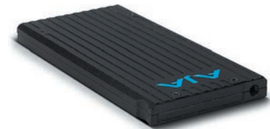
AJA Pak256 and Pak512

External Pak Dock with Thunderbolt and USB 3.0 connections for fast transfer of media to a host computer.