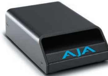
AJA Pak Dock

Ki Pro Quad lets you record edit-friendly 4K, 2K, or HD ProRes files directly to removable AJA Pak Media. Once removed from the Ki Pro Quad, the Pak can be inserted in the AJA Pak Dock which connects directly to your computer via Thunderbolt™ or USB 3.0, allowing you to rapidly transfer ProRes QuickTime files that are ready for use immediately in your non-linear editing system.