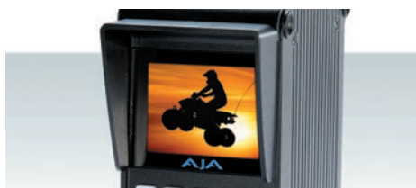
Monitor Hood (included)

Ki Pro Quad has the exact same side dimensions as Ki Pro Mini, allowing both models to share accessories such as the Mini Mounting Plate. This option plate allows you to mount Ki Pro Quad to 3rd-party devices. The plate is attached via 4 supplied screws; plates can be attached to either or both sides of Ki Pro Quad. A large number of screw holes in the plate allows you to mate Ki Pro Quad to 3rd-Party battery plates, hot-shoe adapters and other mounting applications.