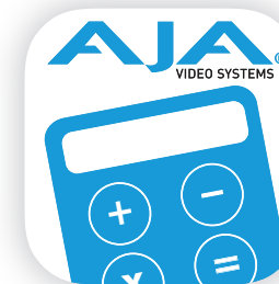
AJA DataCalc Application

AJA Pak Media are High-capacity Solid State drives encased in a protective housing with rugged connection engineered to handle the rigors of repeated use in the field.