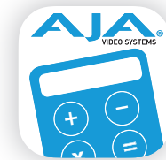
AJA DataCalc Application

This optional accessory can be attached to a Ki Pro Mini Mounting Plate (sold separately). This combination allows Ki Pro Mini to be mounted to user-supplied 15mm camera accessory rods. The accessory plate has knobs for adjusting the height of the rods relative to the Ki Pro Mini Mounting Plate.