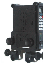
Ki Pro Mini Rod Accessory Plate

This optional plate allows Ki Pro Mini to be connected with 3rd party accessories like battery plates, articulated arms and other mounting devices. Mini Mounting plates can be attached to either or both sides of Ki Pro Mini via the included 4 x 1/4-20 screws. The multitude of pre-drilled screw holes in the plate align with most standard 3rd party accessories.