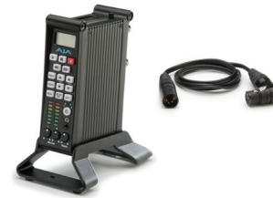
Mini Stand and Adapter Cable

This stand securely holds the Ki Pro Mini upright on a desk, shelf, or any flat surface. A right angle power cable is provided for easy connection between the power supply and the Ki Pro Mini.