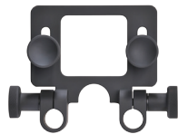
Rod Accessory Plate

For working in direct light situations, a monitor hood is included that screws onto the Ki Pro Quad chassis for a secure fit that helps block direct light onto the built-in confidence monitor.