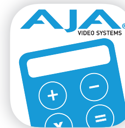
AJA DataCalc Application

AJA Pak Media are High-capacity Solid State drives encased in a protective housing with rugged connection engineered to handle the rigors of repeated use in the field.