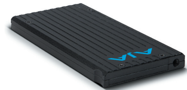
AJA Pak256 and Pak512

External Pak Dock with Thunderbolt and USB 3.0 connections for fast transfer of media to a host computer.