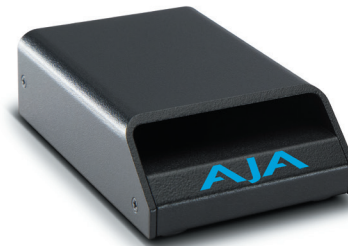
AJA Pak Dock

Ki Pro Quad lets you record edit-friendly 4K, 2K, or HD ProRes files directly to removable AJA Pak Media. Once removed from the Ki Pro Quad, the Pak can be inserted in the AJA Pak Dock which connects directly to your computer via Thunderbolt™ or USB 3.0, allowing you to rapidly transfer ProRes QuickTime files that are ready for use immediately in your non-linear editing system.