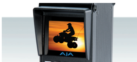
Monitor Hood (included)

Ki Pro Quad has the exact same side dimensions as Ki Pro Mini, allowing both models to share accessories such as the Mini Mounting Plate. This option plate allows you to mount Ki Pro Quad to 3rd-party devices. The plate is attached via 4 supplied screws; plates can be attached to either or both sides of Ki Pro Quad. A large number of screw holes in the plate allows you to mate Ki Pro Quad to 3rd-Party battery plates, hot-shoe adapters and other mounting applications.