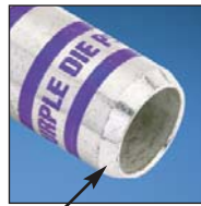
Corona Relief Taper