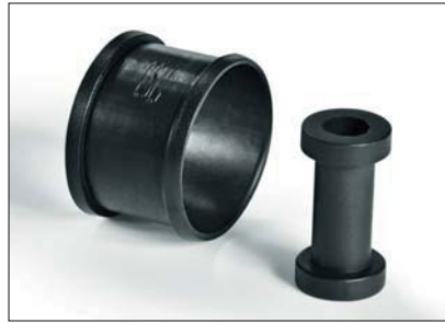
1793-1 supplied / fully recovered.

This product style provides location, cushioning, shimming and protection on cable runs through bulk head or enclosure entry points. Available in a range of materials and adhesives for most applications.