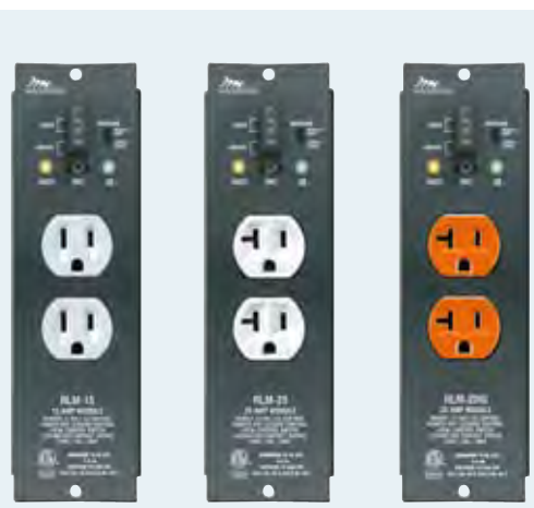
RLM-15 RLM-20 RLM-20IG