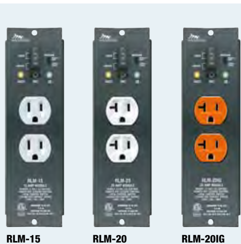
RLM-15 RLM-20 RLM-20IG