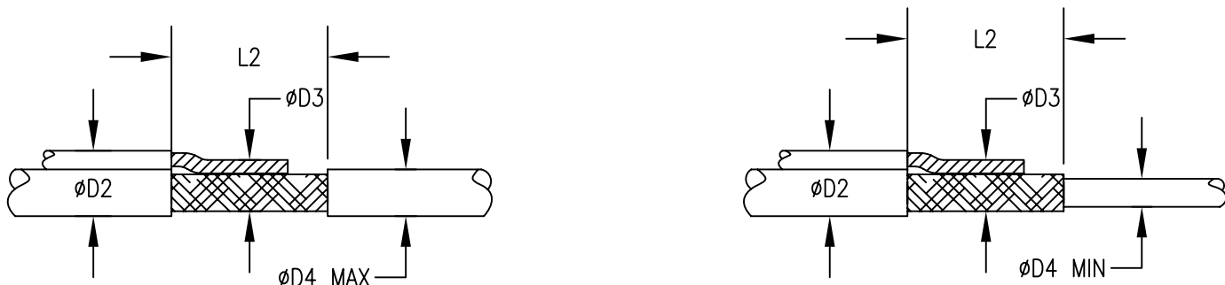
TABLE II: CABLE PREPARATION MEASUREMENTS