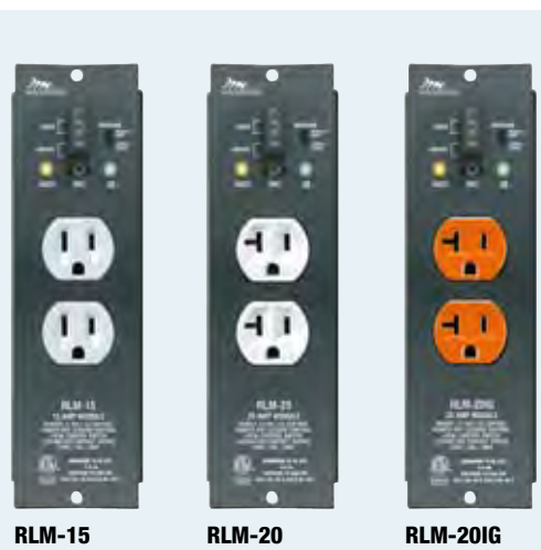
RLM-15 RLM-20 RLM-20IG