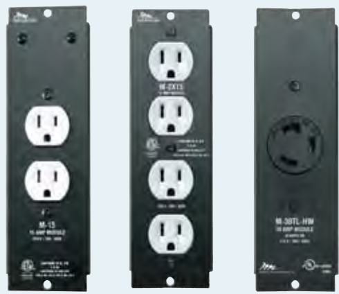
M-15 M-2X15 M-30TL-HW