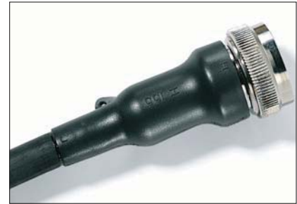
150 Series boot recovered onto a connector.