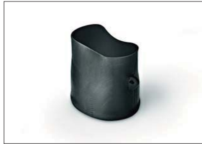
150 Series supplied.

This style is used in conjunction with a circular grooved adaptor, providing strain relief and enviromental sealing. For VG shapes with portholes "P" please refer to product standards tables in the appendix.