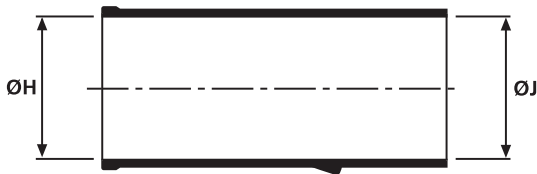
a: Expanded form (supplied)