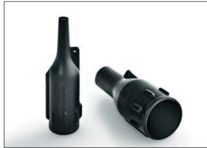
Recovered 199-4-G, VG style shape for small audio connectors with external ribs for improved grip.

This style was developed specifically for small audio connectors with multiple external ribs to improve grip in harsh conditions.