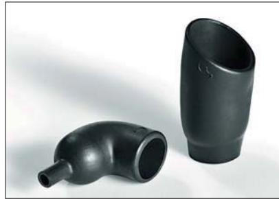
1114-1 supplied / fully recovered.

This style provides connector cable strain relief. Can be installed on the connector rear thread or plain shaft, allows easy re-entry for repair when combined with a hot melt adhesive.