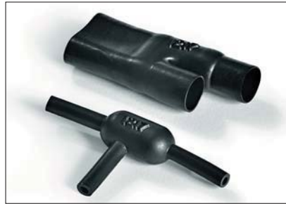
1217-1 supplied / fully recovered.

This style provides strain relief, sealing and mechanical protection where a cable transition is required on the harness, it is recommended that an adhesive be used if environmental sealing is required.