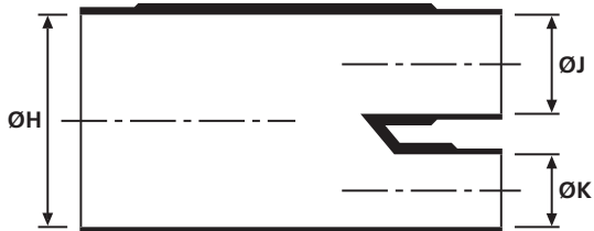
a: Expanded form (supplied)