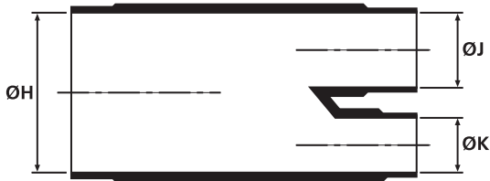
a: Expanded form (supplied)