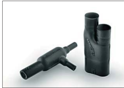
1204-1 supplied / fully recovered.

This style provides strain relief, sealing and mechanical protection where a cable transition is required on the harness, it is recommended that an adhesive be used if environmental sealing is required.