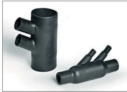
1310-1 supplied / fully recovered.

This style provides strain relief, sealing and mechanical protection on cable harnesses where a specialised orientation is required.