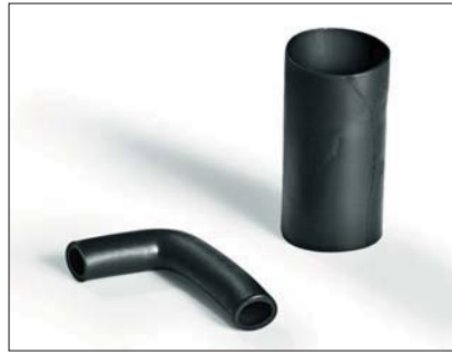
1403-1 supplied / fully recovered.

This style provides strain relief and mechanical protection on cable orientations of up to 90°, efficient design and numerous material / adhesive combinations provide quick and easy installation across a range of applications.