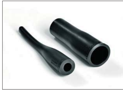
1751-1 supplied / fully recovered.

This style is ideally suited for shipboard and railway carriage cabling. The key features are: very robust, superior crush resistance and excellent strain relief. The wall thickness varies with long tail, allowing setting at varying angles through 90°.