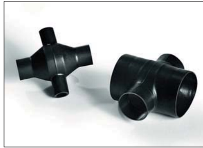
2003-1 supplied / fully recovered.

This style allows wires to be routed in four 90° directions, whilst providing strain relief and mechanical protection. Environmental sealing can be achieved when used in conjunction with one of our extensive range of adhesives.