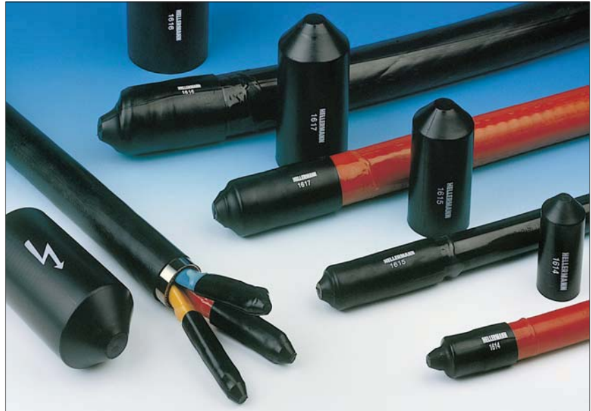
The appropriate end cap for any diameter and type of cable.

End caps are suitable for use on both polymeric and paper insulated, lead jacketed cables which may include aluminium or steel armouring.