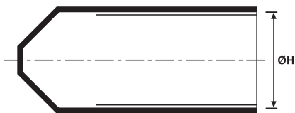
a: Expanded form (supplied)