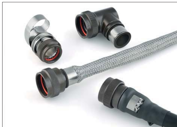
Zetalok installation system.