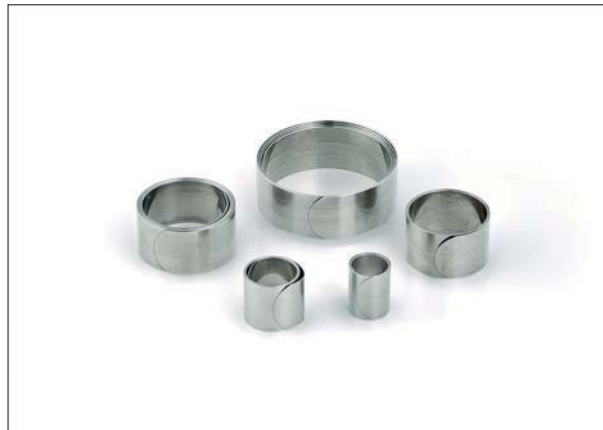
The various spring sizes.

Predominantly used in the Aerospace, Defence and Professional Electronics sectors.