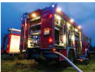
Aramid Flexo NX is at work every day protecting our firefighters and first responders from injury.