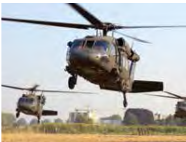
Proven in the air... ...Proven on the ground