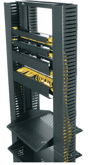
PCD shown on RLA series 2 post rack