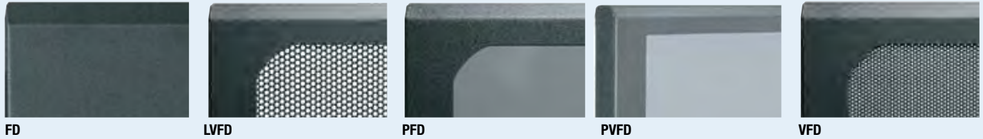
Front Door Part # (Fits MRK, VRK, VMRK, WRK, ERK, DWR, SR Series)

Offered in lightly smoked plexi, 25% open area perf, 64% open area perf, plexi-vented and solid configurations. Beveled corners provide a stylish modern appearance while hinging either left or right. Black textured powder coat finish. Includes keylock.