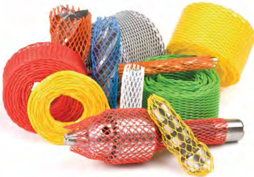
Part Guard protects precision surfaces from damage.

Part Guard is available in an expandable, medium duty type (PGE) or a thicker, non-expandable product (PGN). Each size is defined by a discrete color, allowing quick and easy visual identification of the diameter, and simplifying inventory management of various products.