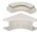
Internal Elbow PP1IEBC