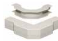
External Elbow PP1EEBC