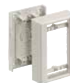
Low-Profile Box PW1LPB