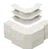
External Elbow PW2EEBC