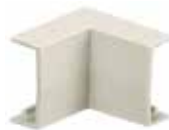
Internal Elbow PW1IE