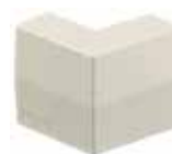
External Elbow PW1EE