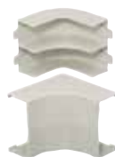
Internal Elbow PW2IEBC