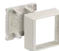
Deep Box, Undivided PDB12TGD