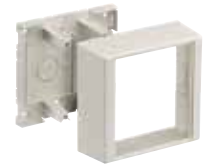
Deep Box, Undivided PDB12TGD