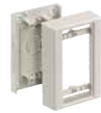
Low-Profile Box PW1LPB