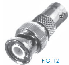
FIG. 12 RFB-1138

PHOTOS FOR REFERENCE ONLY, SHOWN AT 100% ACTUAL SIZE.