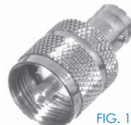
FIG. 11 RFB-1137