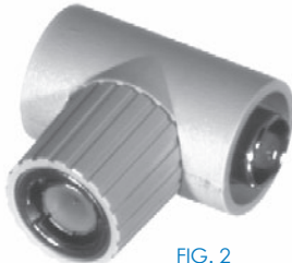
FIG. 2 RFB-1130-2