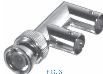
FIG. 3 RFB-1130-3