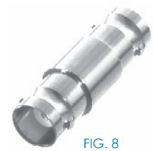
FIG. 8 RFB-1134