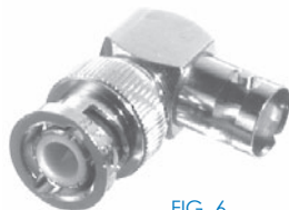
FIG. 6 RFB-1132