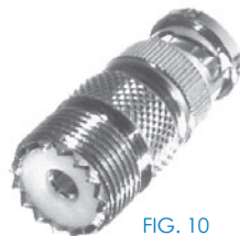
FIG. 10 RFB-1136