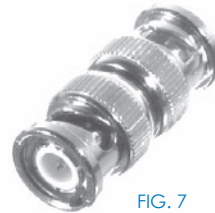
FIG. 7 RFB-1133