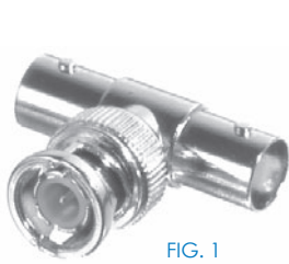
FIG. 1 RFB-1130, -1

Body: G - Gold N - Nickel S - Silver Pin/Contact: G - Gold N - Nickel S - Silver T - Tin Dielectric: D - Delrin PE - Polyethylene T - PTFE