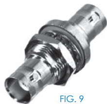
FIG. 9 RFB-1135, -I, -T