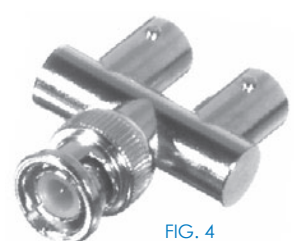
FIG. 4 RFB-1130-5