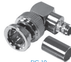
FIG. 10 RFB-1710-Q