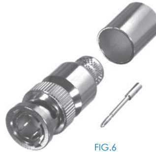
FIG. 6 RFB-1707-R, R1