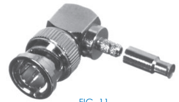
FIG. 11 RFB-1710-S, -S1

PHOTOS FOR REFERENCE ONLY, SHOWN AT 100% ACTUAL SIZE.