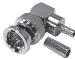
FIG. 9 RFB-1710-K,