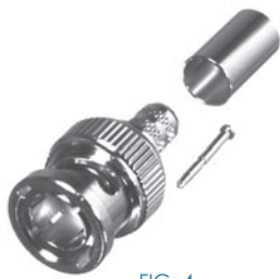
FIG. 4 RFB-1707-D