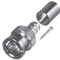
FIG. 5 RFB-1707-2, -D2, -D3, -G, -J, -K, -Q, QQ, Q1, -S, S1 RFB-1708, -1T