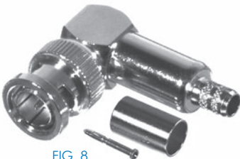
FIG. 8 RFB-1710-D