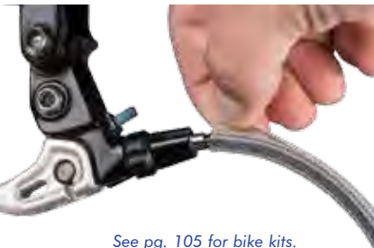
See pg. 105 for bike kits.