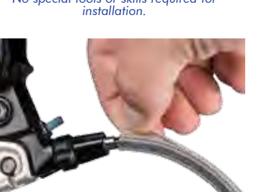
See pg. 105 for bike kits.