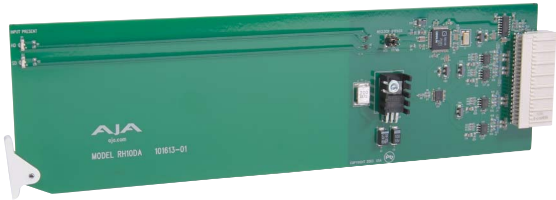
RH10DA Card Module, Side View