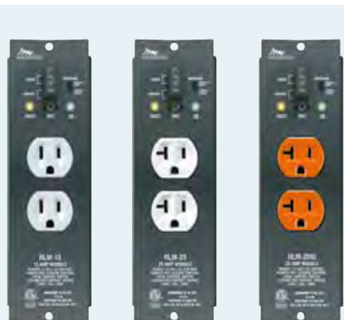
RLM-15 RLM-20 RLM-20IG