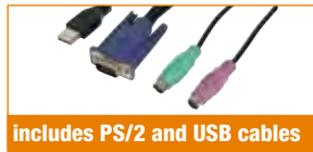
includes PS/2 and USB cables