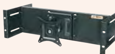
RM-LCD-PNLK tilt open panel style