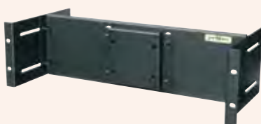
RM-LCD-PNLV fixed open panel style