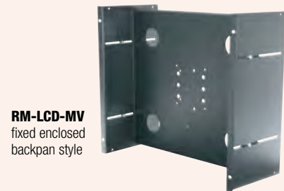
RM-LCD-MV fixed enclosed backpan style