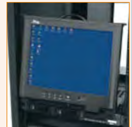
screen opens with keyboard retracted for monitoring