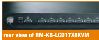
rear view of RM-KB-LCD17X8KVM