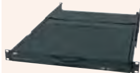
shown in closed position