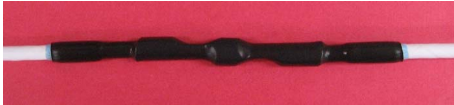
Picture 2. Installed RT-555 sealing sleeve on splices