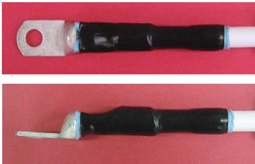
Picture 1. Installed RT-555 sealing sleeve on terminals