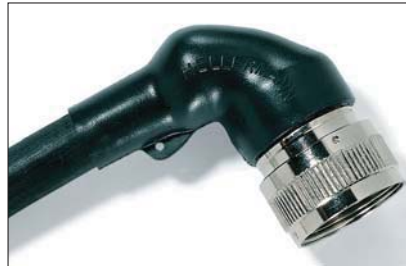
1152-4-G recovered onto a connector.

This style provides strain relief for harness systems when used in conjunction with a circular grooved adaptor. For VG shapes with portholes "P" please refer to product standards tables in the appendix.