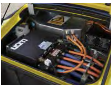
Tomorrow's electric vehicles are more compact with higher power. Flex Glass FR is designed to control up to 7,000 volts in tight spaces safely and efficiently.

SF sleeving is rated to 392°F. (Class H), is abrasion resistant, and maintains its flexibility in low temperature environments. SF is available in a very wide range of sizes, and is ideal for use in appliance assemblies, wire harnesses, transformer leads, power supplies, motor coil, and heater leads.