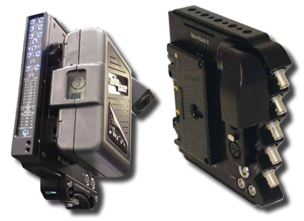
All the Signals that You Need for D-SNG, News, Studio & Multi-Camera Production...Small and Lightweight...and Light on Your Budget

The new SilverBack-II has been completely re-designed to provide a full complement of bi-directional signals for most any digital camcorder on the market today. These include camera systems from GVG, Hitachi, Ikegami, Panasonic and Sony!