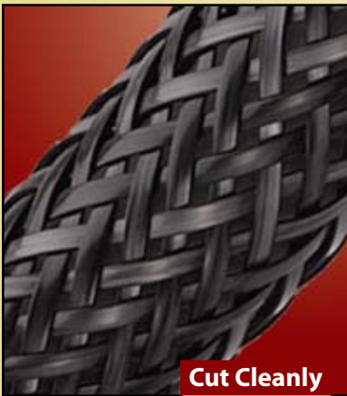
Cut Cleanly Hot Knife