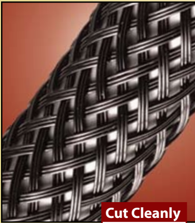
Cut Cleanly Hot Knife